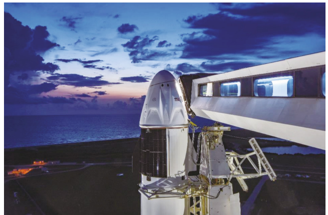
Fig. 3. SpaceX's Inspiration4 mission, the company's first to carry only tourists, prepares to lift off from the Kennedy Space Center in Florida in September 2021. The crew members spend three days orbiting the Earth, reaching an altitude of 585 km.

Fig. 2. (a) After a successful liftoff in April 2021, Blue Origin's re-usable New Shepard booster returned to the launch pad. (b) The crew capsule from the rocket parachuted to the surface after separating from the booster.